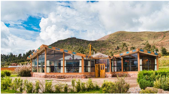
Marastambo Retreat Center