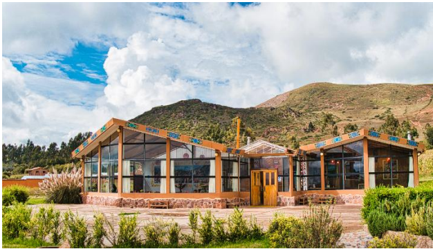
Marastambo Retreat Center