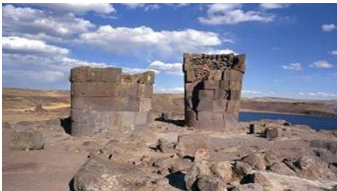
Chullpas of Sillustani