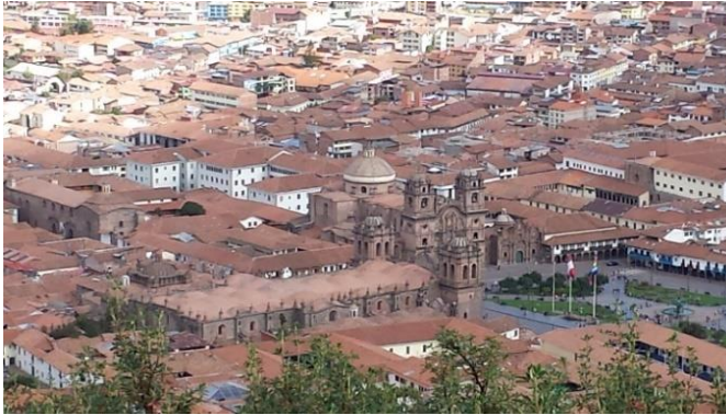
City of Cusco