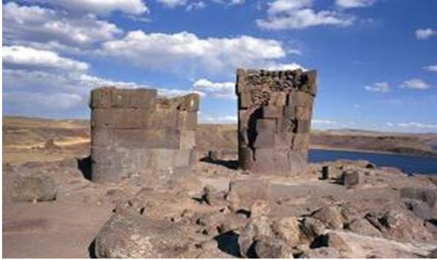
Chullpas of Sillustani