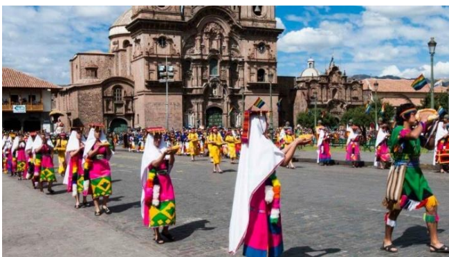
Inti Raymi in Cusco